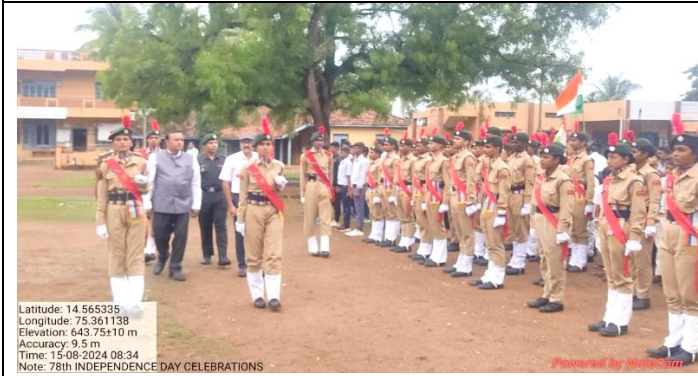
Parade Nirikshan: By Principal