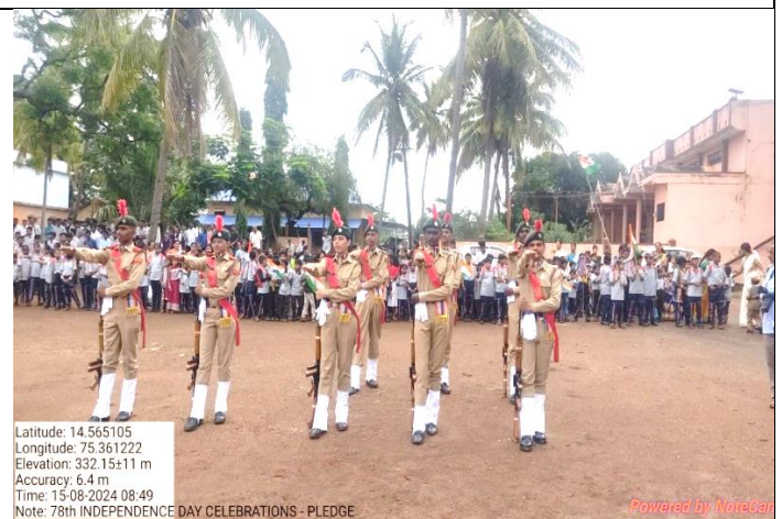
Oath by Guard Party